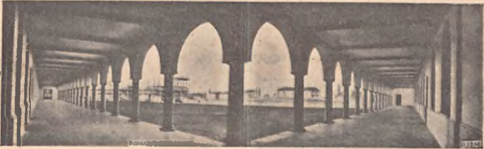
Rome. — The Ambulacrum of the Pius XI Institute.

(From the speech of His Holiness on the occasion of the reading of the Decree approving the miracles for the canonization of Don Bosco, 19-11-33).