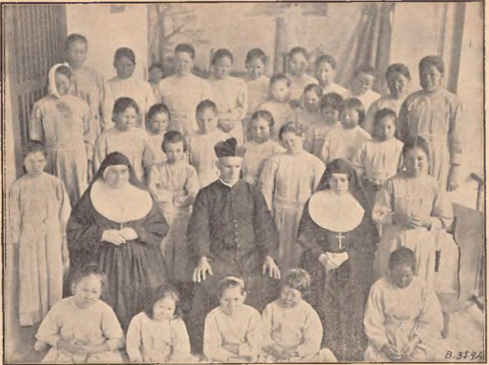
Leper Girls under the care of the Daughters of Mary Help of Christians.

Church and the salvation of souls, each one of them can repeat the words of St. Paul: Adimpleo quae desunt passionibus Christi in carne mea, pro corpore eius quod est Ecclesia : "I fill up those things that are wanting of the sufferings of Christ, in my flesh, for his body, which is the church." ( Coloss. , I, 24-25). Thus they sanctify the Holy Jubilee Year of the Redemption, by uniting their own sufferings to the sufferings of Christ, and offering them in union with the merits of His Passion and Death on behalf of the Church.