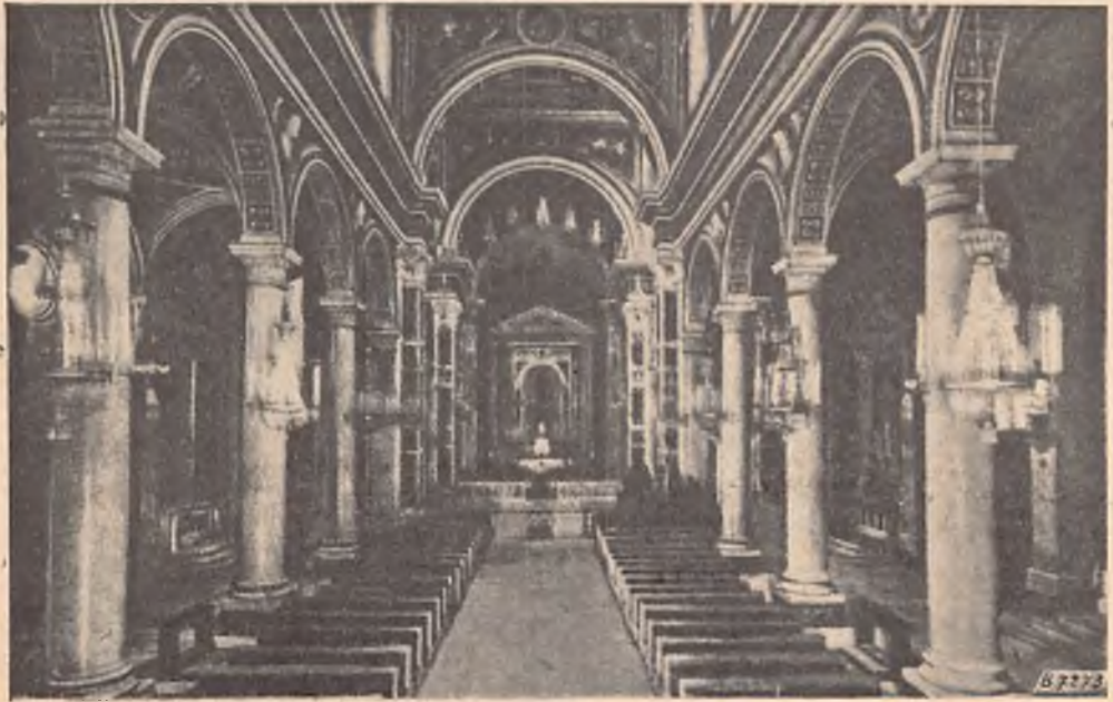
Rome. — Interior of the Sacred Heart Basilica.

and who had at the time many other undertakings in hand, hesitated. It was a gigantic task and sources from which money might be expected were few. To be brief, Don Bosco was finally received in audience by Leo XIII on April 5th. The Pope then manifested his desire, stating how pleasing to him would be an acceptance, and how keenly he felt his own impotence to continue.