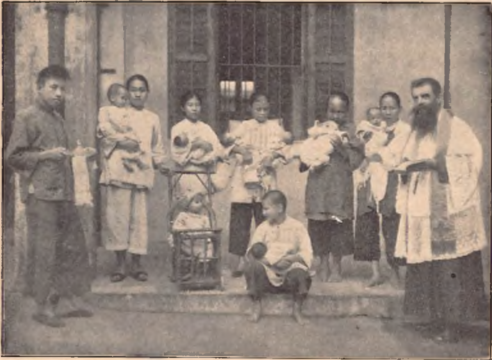
China. — The Work of the Holy Infancy: Newly-baptized babies.