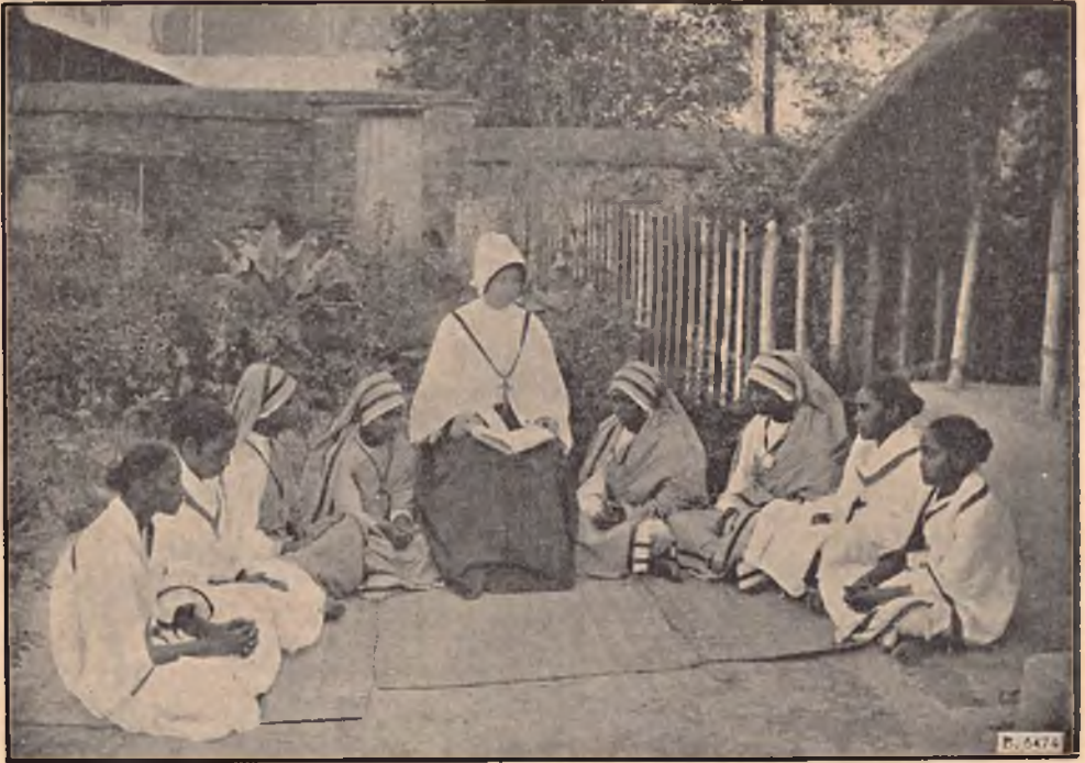
India. — A Group of Native Female Catechists.

might easily become masters once again. It is not to be wondered at, then, that in Delhi many thousands of these "untouchables" went over to the religion of Mahomet, and that throughout India the Moslem priests solemnly declared that their mosques would henceforth remain open to these "untouchables," and to as many others as should, like them, be converted, and that all, without distinction, would enjoy the same rights,