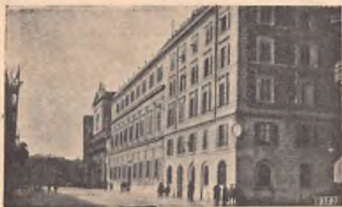
Rome. — The Sacred Heart Hospice. - Exterior.

with you in so holy a work, on which I invoke from this moment the blessing of God."