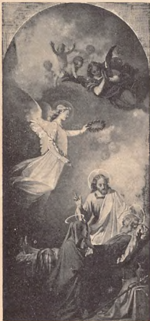
The Death of St. Joseph.

Remarkable, nay unique, were the powers and the graces which God showered upon St. Joseph. He was the man favoured by heaven, upon whom the choice of the Lord rested. He was chosen by the Almighty to be the foster-father of the Word made flesh. To him could well be applied those words of