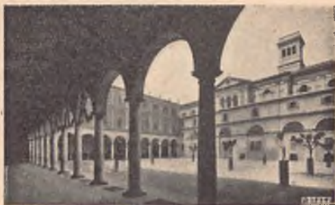
Rome. — A view of the Courtyard of the Sacred Heart Hospice.

(1) Two million Italian lire were needed to build the church, and another million and a half to build the hospice; figures, which in times of such difficulty as were those in which the work was done, speak for themselves!