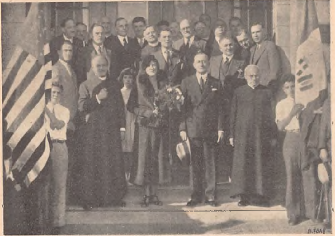
Senator Marconi at the Salesian House in San Francisco U. S. A.

the solemn consecration of the students to Jesus Adolescent. This was read by one of the young sodalists, who, dressed in cotta and cassock, and kneeling on the altar steps, consecrated, in accents young and fresh, the entire students, in the flower of their youth, to Christ Adolescent, solemnly promising Him to keep it unspotted and holy.