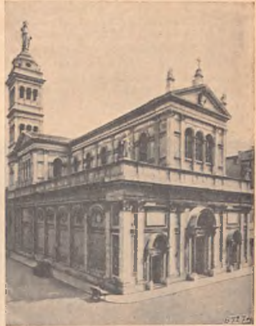
Rome. — Basilica of the Sacred Heart - Exterior.

At first all went well. Building operations were commenced, but the work had not gone far when an occurrence sufficiently common in Rome took place. Subterranean galleries were discovered beneath the site; they had been made many centuries before to secure