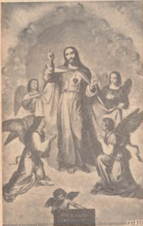
Painting above the High Altar in the Sacred Heart Basilica.

The holy Pontiff at the time, Pius IX, was at once on the alert. He saw clearly the religious needs of this vast area and was quick to grasp the fact that the existing parishes could no longer cope adequately with the demands made upon them. Times for the Papacy were hard. The Papal States had just been ruthlessly snatched away and the Pope was absolutely without means to carry out the works he would have liked to undertake. On Dec. 8th. 1870 he had de-