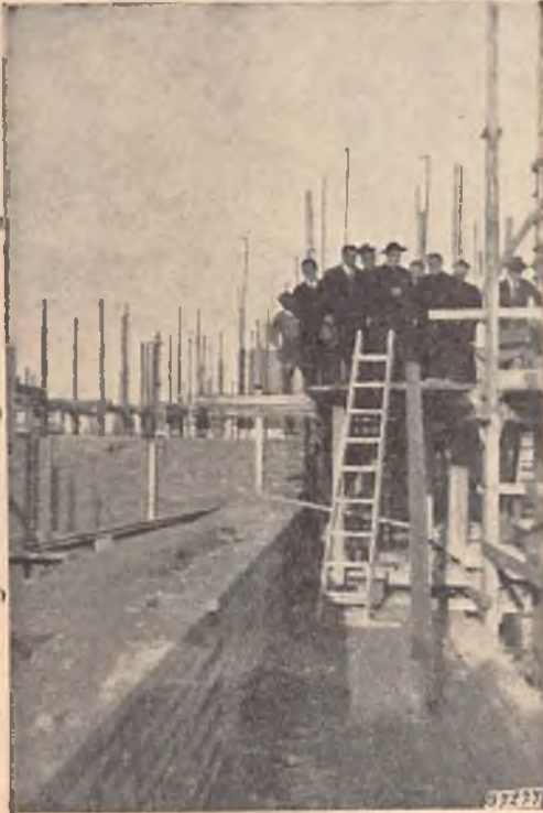
Rome. — The Superior General inspecting the work on the new Church of Our Lady, Help of Christians.

1 - Priest co-operators enjoy the personal favour of a Privileged Altar on three days a week, unless they have obtained a similar indulgence for another day.