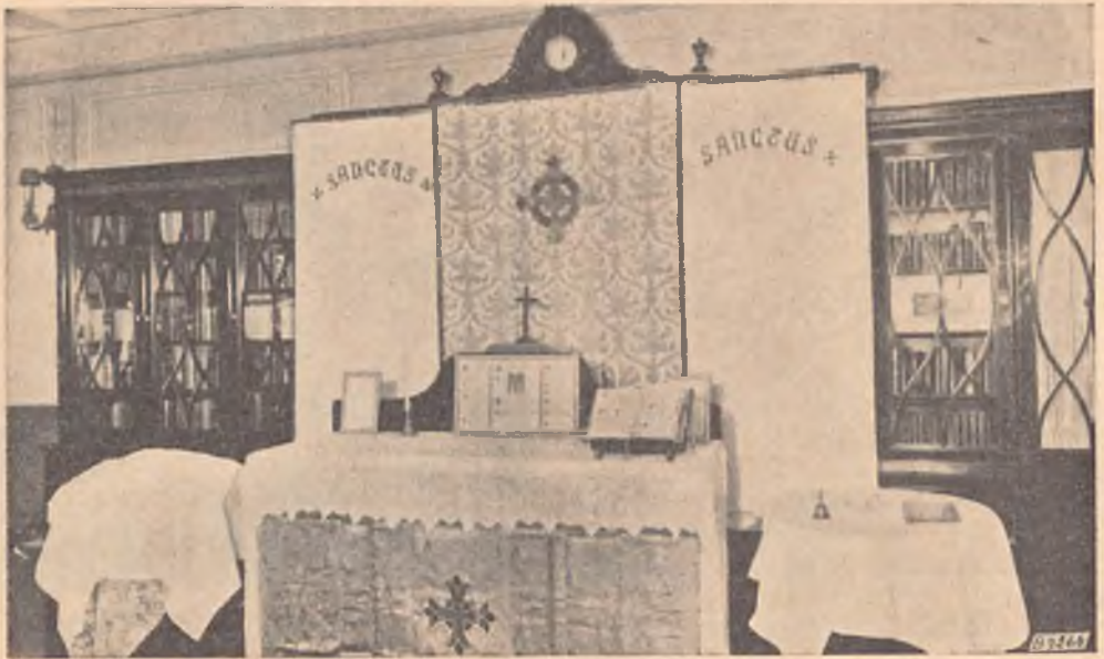
The Altar in the Library of the R. M. S Majestic .