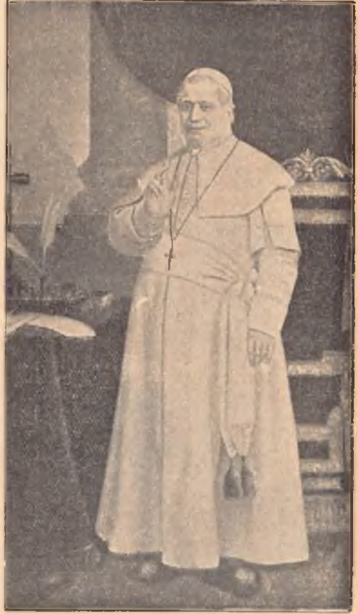
His Holiness Pope Pius IX.

1 For any One of these ejaculations, at their choice, a Plenary Indulgence.