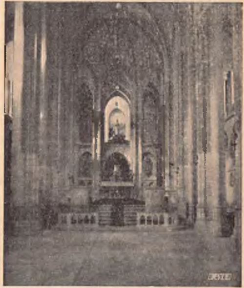
Nazareth. — Salesian Church of Jesus Adolescent.

Before the young, enthusiastic soul let our psychology be not lacking. Let us encourage it to scale the mount till it reaches even to the crest hidden beyond the snows, Christ Adolescent: ad montem quae Christus est , "to the mountain which is Christ." (1).