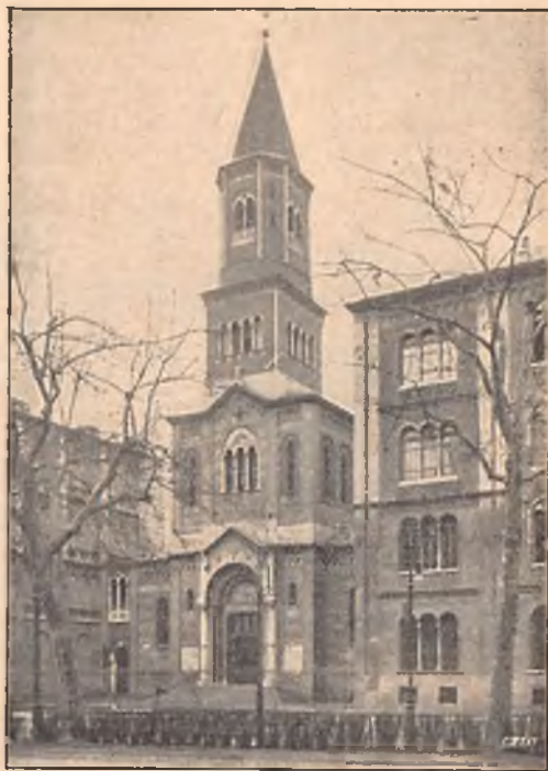
Turin. — Church of St. John the Evangelist, built by Don Bosco.