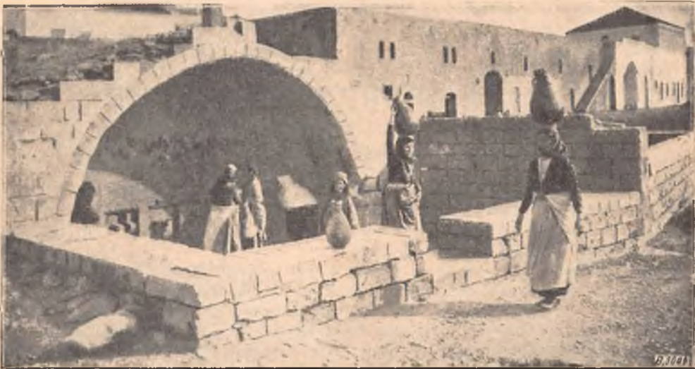
Our Lady's Well at Nazareth.

Among all the titles adopted by Christ in the Gospels to affirm the full sense of His mission, there is one to which He returned with insistence. It is that He is the Model , the Type of Perfection which we must copy to attain to eternal life. "I have given you," He says to the twelve at the Last Supper, "an example, that as I have done, so do you also." And Christian generations have so well understood that He was the Ideal incarnate of the Christian, that the most beautiful book that ever was written by the hand of man treats the theory of this ascetism in its immortal pages. The Imitation of Christ is the practical manual of the task which every christian has to do.