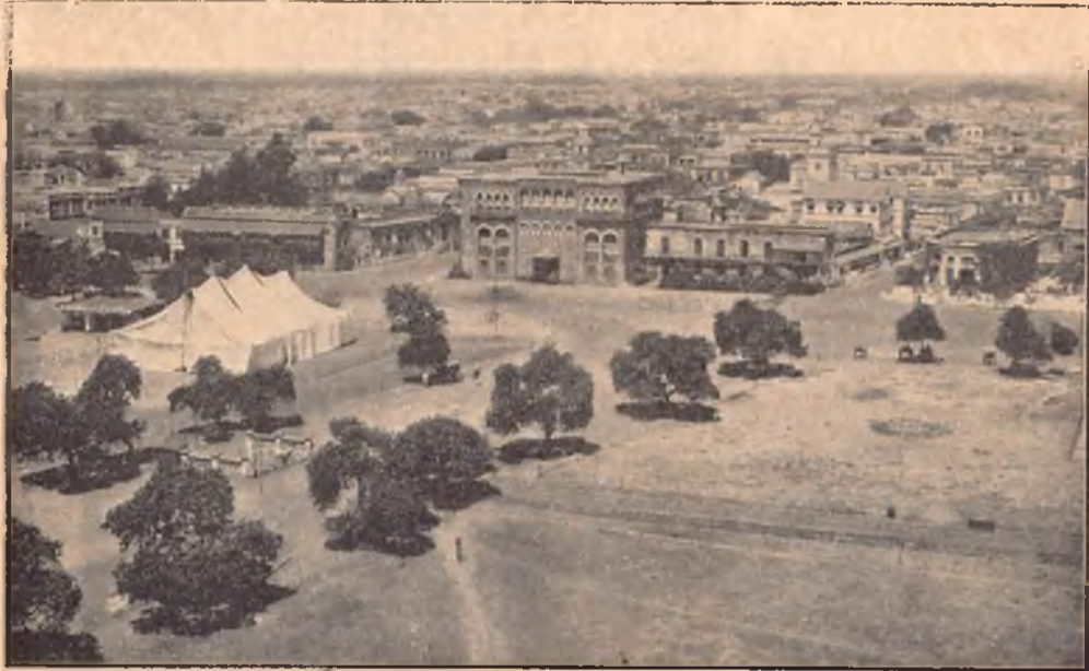
Madras, India. — A General View of the City.

A short time ago, attention was drawn in the Bulletin to the St. Louis Industrial School, conducted by the Salesians at Hong Kong;