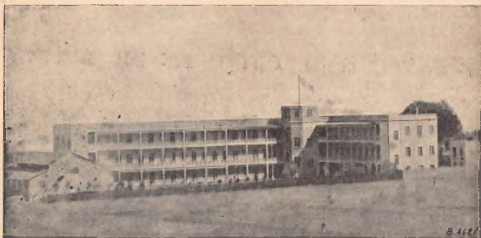
Cairo, Egypt. — The Salesian Institute and Professional School.